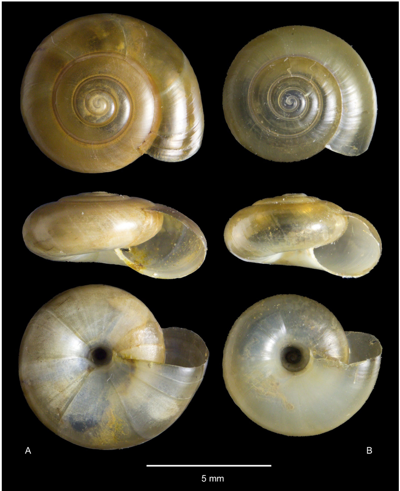
Figure 1. A, Oxychilus translucidus (Mortillet, 1863) Butterfly House, Whipsnade Zoo, Bedfordshire, 2017 (width 7.6 mm). B, O. alliarus (J.S. Miller, 1822) near Sheffield Park, East Sussex, 1975 (width 6.3 mm).